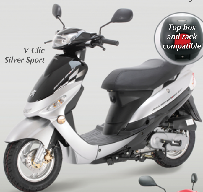
V-Clic Silver Sport

** MPG figures are meant only as a guide. Variations can be caused by environmental conditions, rider weight, tyre pressure and many other factors.