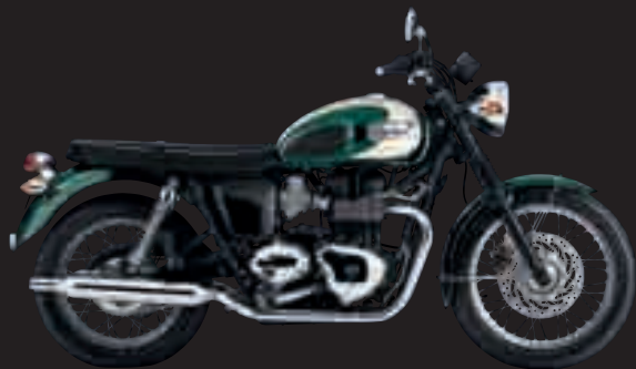
BONNEVILLE T100 FOREST GREEN AND NEW ENGLAND WHITE