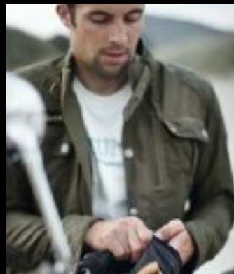
TRIUMPH CLOTHING p38 Whoever you are. Whatever you ride. Whatever the weather. This is the gear. Genuine Triumph clothing.