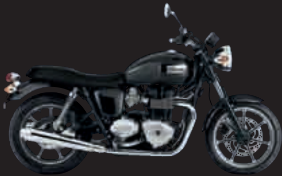
BONNEVILLE SE JET BLACK