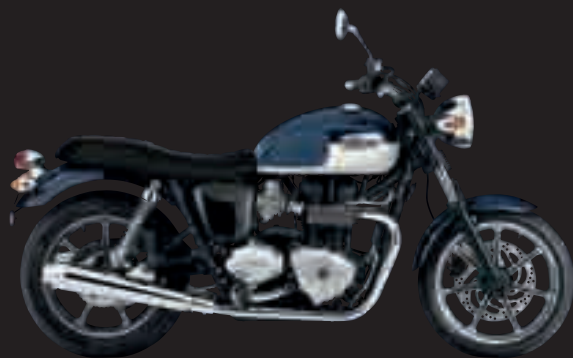
BONNEVILLE SE PACIFIC BLUE AND FUSION WHITE