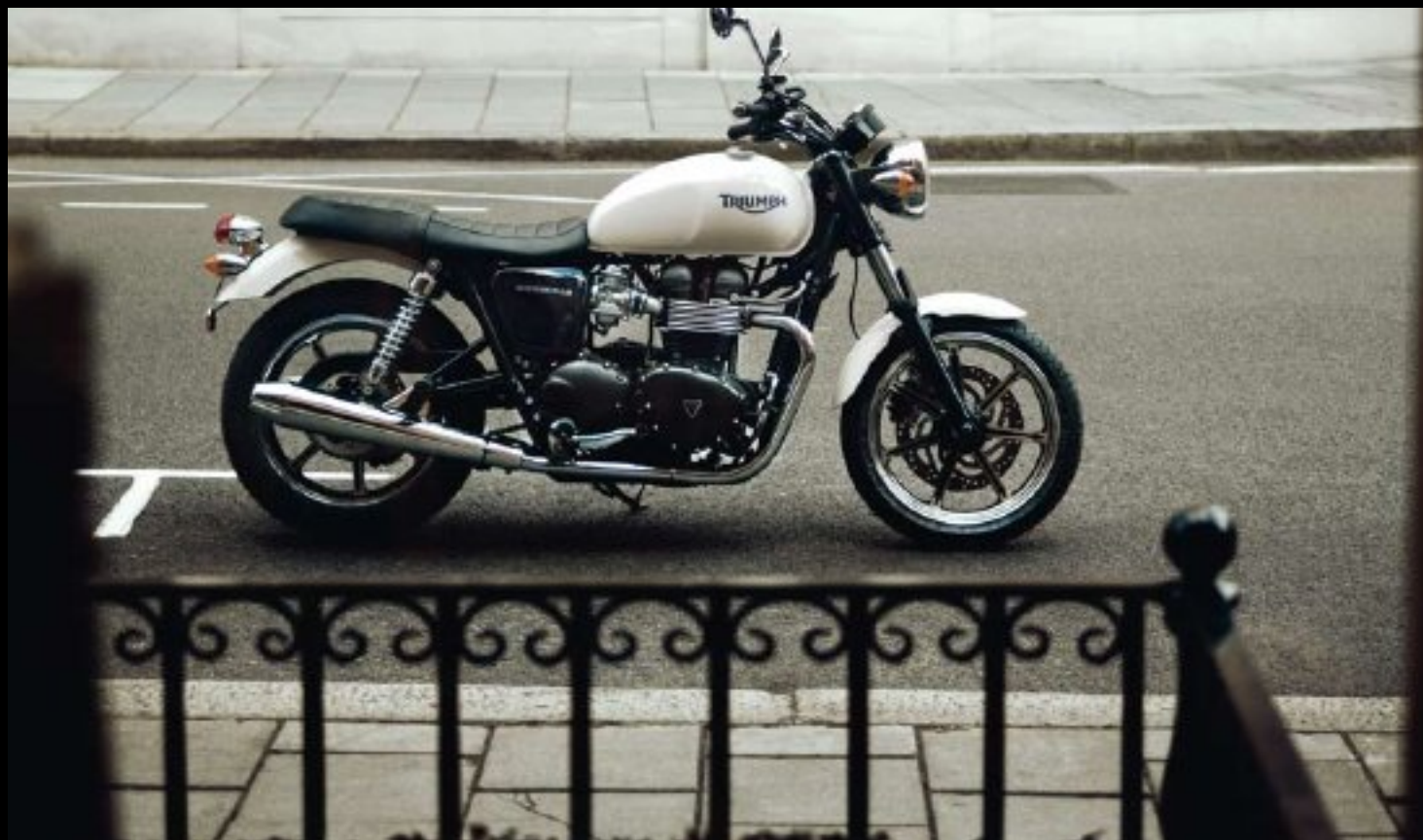
BONNEVILLE FUSION WHITE