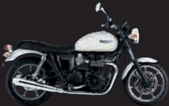
BONNEVILLE FUSION WHITE