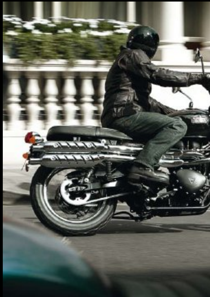
SCRAMBLER JET BLACK