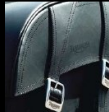
CREATE MY TRIUMPH p39 Have it your way. Exactly your way. By personalising your Triumph online at triumphmotorcycles.com Any bike. Any accessory. Any colour.