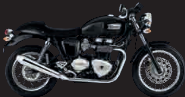
JET BLACK WITH GOLD STRIPE