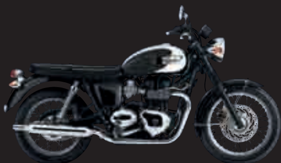
BONNEVILLE T100 JET BLACK AND FUSION WHITE