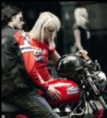
THRUXTON p26 The café racer. Reinvented. SPECIFICATIONS p31