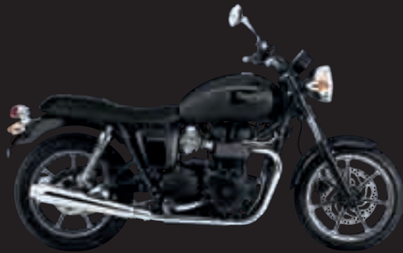
BONNEVILLE JET BLACK