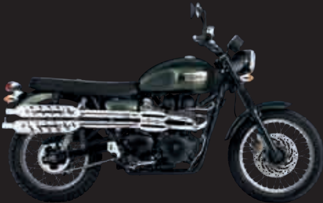
MATT KHAKI GREEN