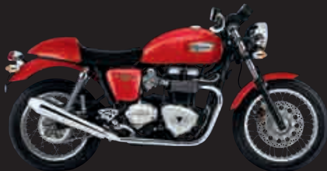
TORNADO RED WITH WHITE STRIPE