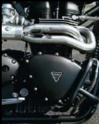
SCRAMBLER p32 No-nonsense 60s attitude. Ready for Action. SPECIFICATIONS p37