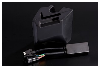
IPOD ADAPTER CABLE £ 114.95