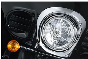
Muscular front cowling