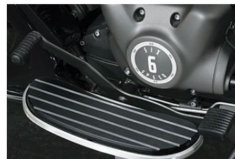
6-speed transmission with overdrive