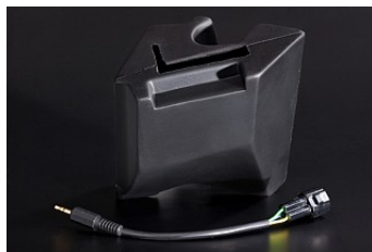
MP3 CONNECTOR KIT £ 50.95