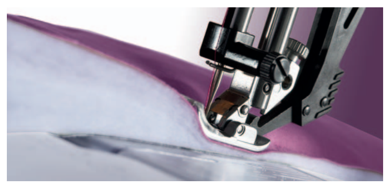
Lots of space to stitch through thick fabrics or several layers.