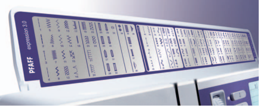
Select from a variety of stitches, alphabets (model 3.0 only) and buttonholes.