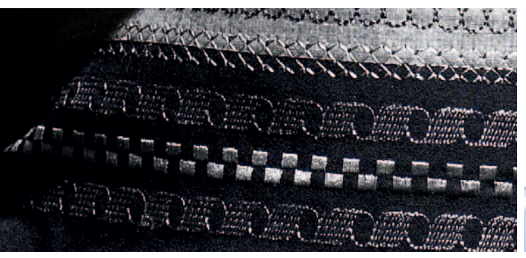
Every project you sew becomes uniquely yours.