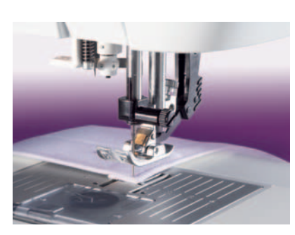
Set the needle to stop up or down in the fabric, with just a tap of the foot control.

Thanks to the electronic needle piercing power , perfectly even stitches are guaranteed.