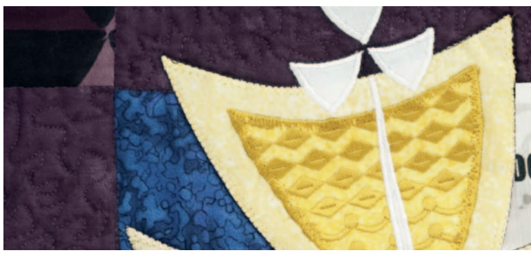
The quilt becomes uniquely yours.