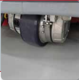
New polyurethane drive and rear tyres: outstanding traction, either on dry or wet floors, non marking, high wear resistance

Furthermore, the new Ecoflex system is now available, which keeps the consumption control, but it also guarantees the possibility to boost temporarily water, detergent and brush pressure for all the more aggressive cleaning tasks. For large area commercial and industrial floor cleaning applications, there is simply no better choice.