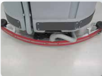
Complete new squeegee concept: perfectly adherent to the floor, extremely reactive on curves, easily adjustable ... for excellent drying results