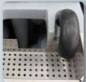
New recovery tank inlet system (180 degree recovery diverter + debris tray), for a quicker e more efficient cleaning