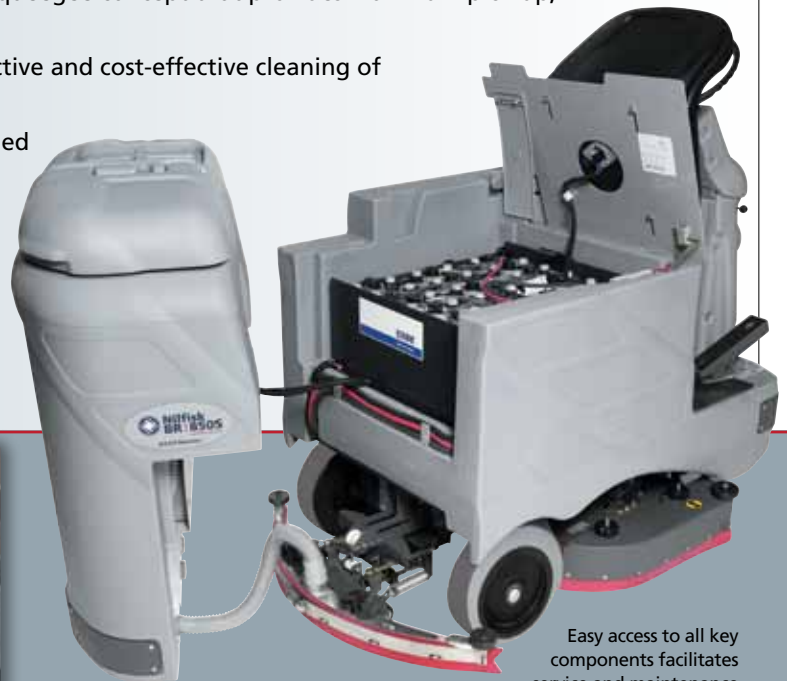
Easy access to all key components facilitates service and maintenance