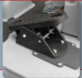
New robust glass filled nylon foot pedal and improved potentiometer