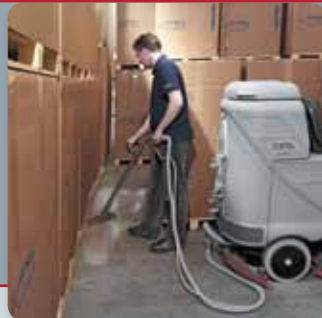
This compact machine offers a high level of productivity and efficiency in large industrial areas.