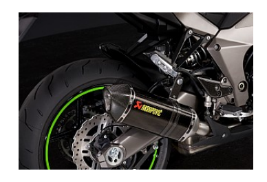
AKRAPOVIC EXHAUSTS* £ 1,026.95