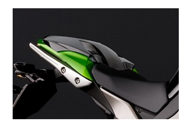
PILLION SEAT COVER £ 223.95