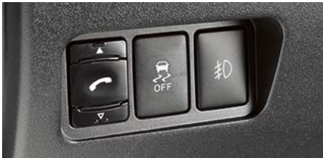
BLU Logic® Hands Free System 19