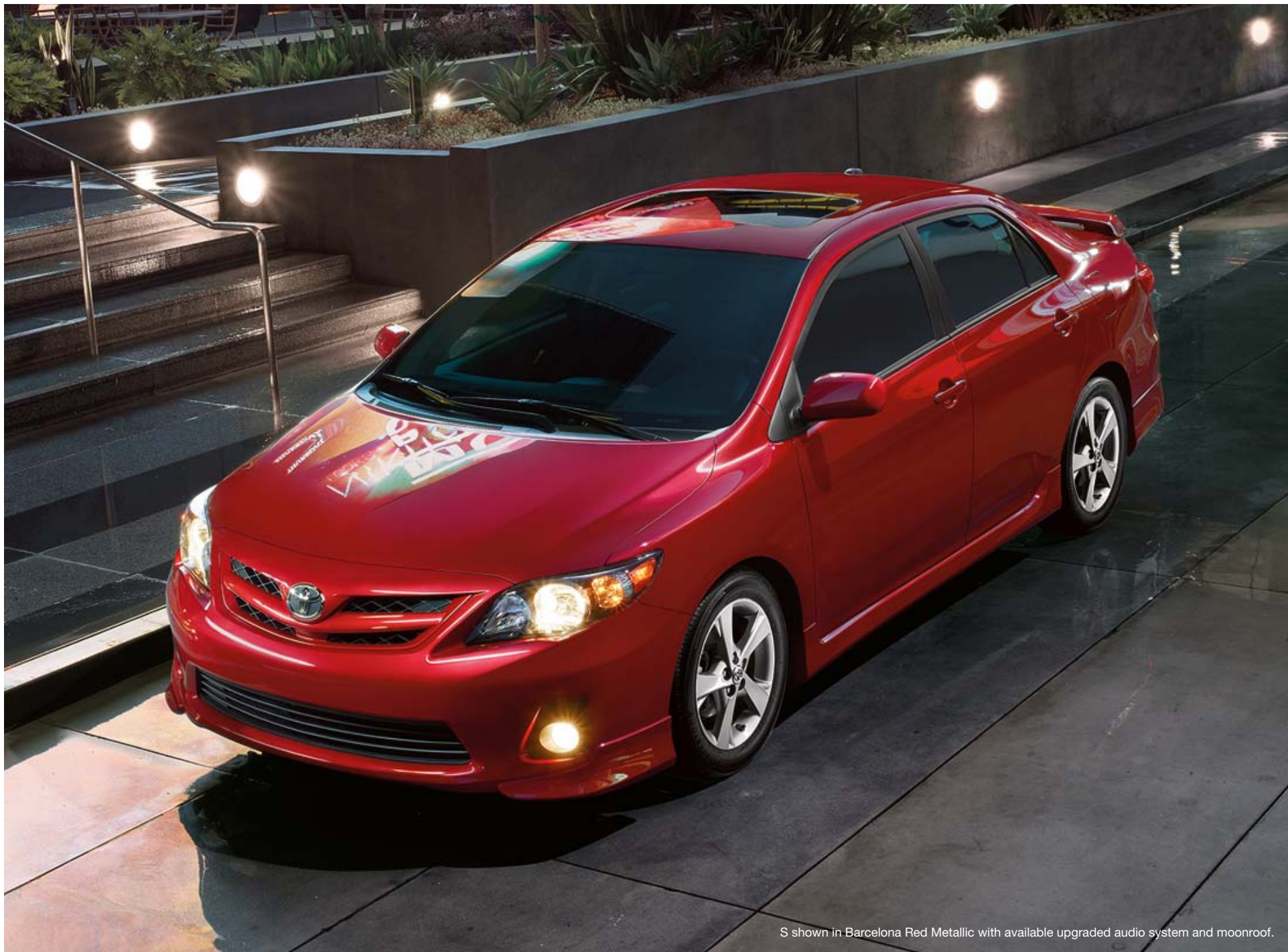
S shown in Barcelona Red Metallic with available upgraded audio system and moonroof.