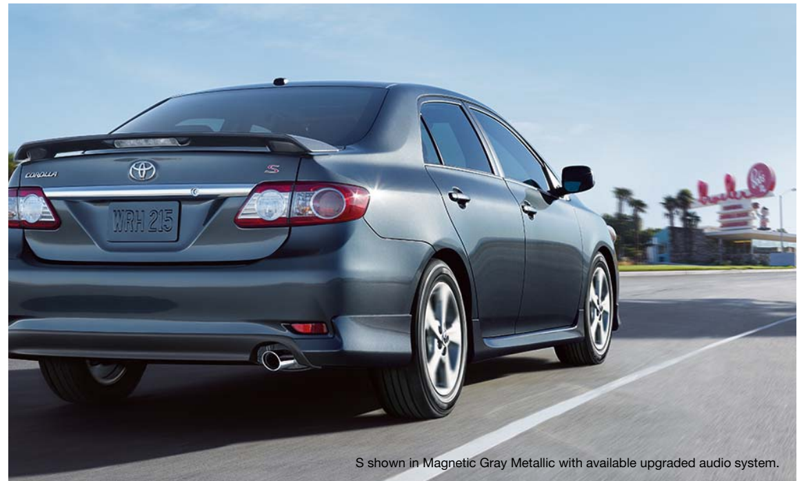
S shown in Magnetic Gray Metallic with available upgraded audio system.

Corolla's impeccable road manners begin with its rigid chassis. Built to resist body flex, it provides a reliable platform so that the suspension can best do its job. The front suspension, mounted to an additional sub-frame to reduce noise and vibration , is tuned for precision handling. In back, the rear suspension employs a torsion-type design that further smooths the ride quality .