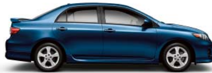
NAUTICAL BLUE METALLIC Ash, Bisque or Dark Charcoal 1 interior