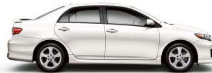
SUPER WHITE Ash, Bisque or Dark Charcoal 1 interior