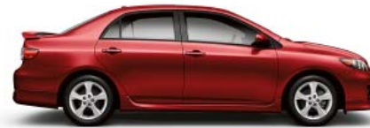
BARCELONA RED METALLIC Ash, Bisque or Dark Charcoal 1 interior