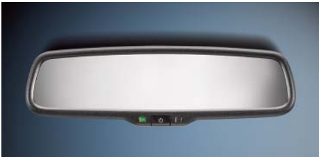
Auto-dimming rearview mirror