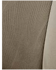
LE fabric in Bisque