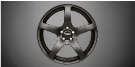
TRD 18-in. 5-spoke wheels (Silver or Black)