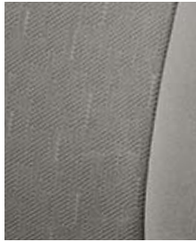
Corolla fabric in Ash