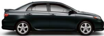
BLACK SAND PEARL Ash, Bisque or Dark Charcoal 1 interior

Corolla offers seven exterior colors to choose from — not surprising, considering Corolla's accommodating nature. And each exterior color offers two or three interior colors to match. Decisions, decisions.