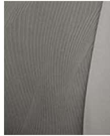
LE fabric in Ash