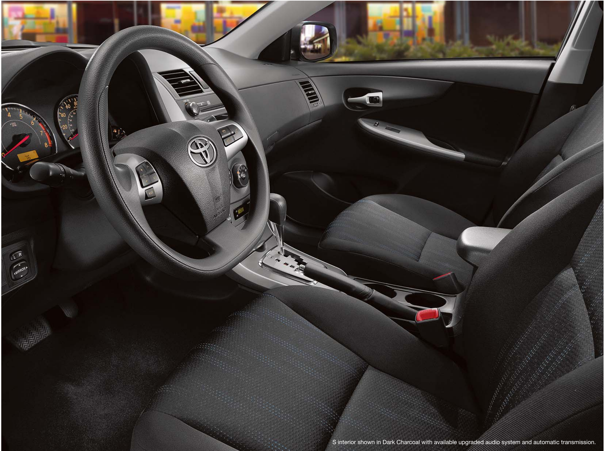
S interior shown in Dark Charcoal with available upgraded audio system and automatic transmission.