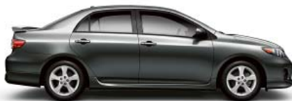
MAGNETIC GRAY METALLIC Ash, Bisque or Dark Charcoal 1 interior