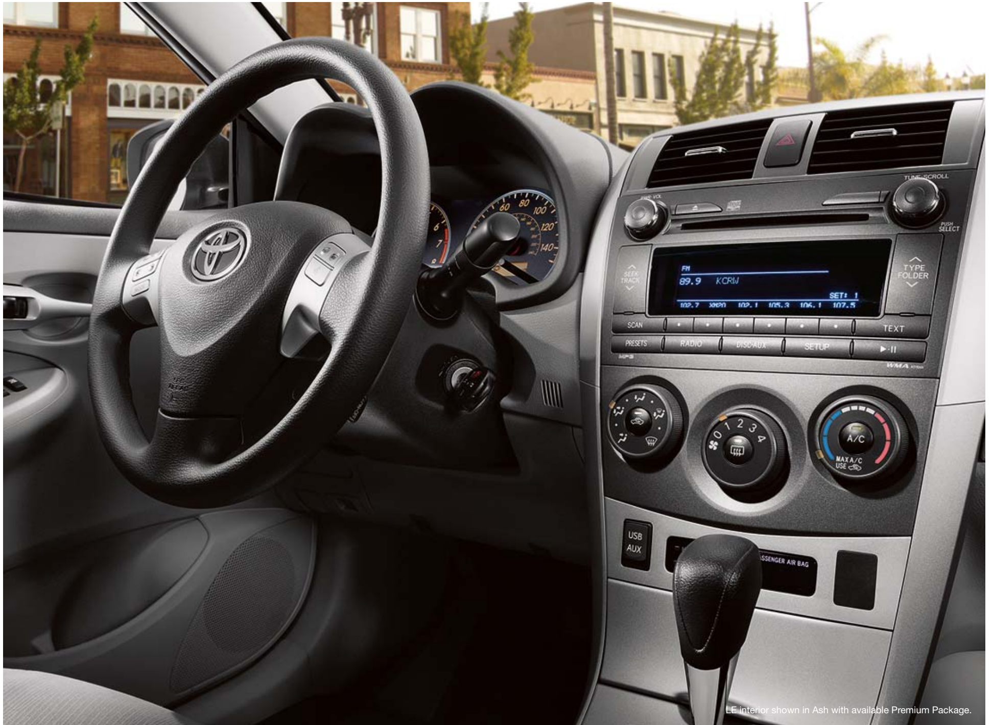
LE interior shown in Ash with available Premium Package.