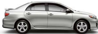
CLASSIC SILVER METALLIC Ash or Dark Charcoal 1 interior