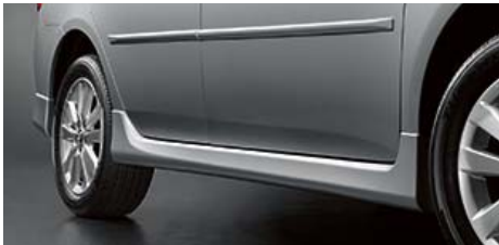
Body side moldings

Add a personal touch to your Corolla with Genuine Toyota accessories. Some accessories may not be available in all regions of the country. See your Toyota dealer for details.