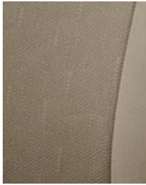
Corolla fabric in Bisque