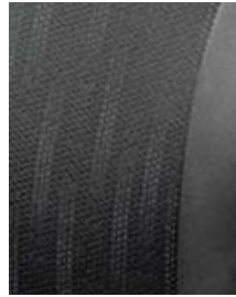
S fabric in Dark Charcoal