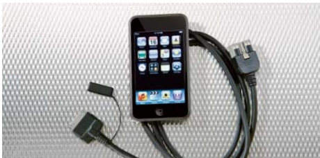
Interface kit 20 for iPod ®11