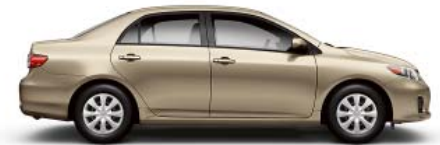
SANDY BEACH METALLIC 2 Bisque interior