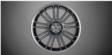
TRD 18-in. multi-spoke alloy wheels